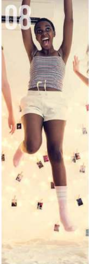
10 ROOMMATE SEARCHING TIPS