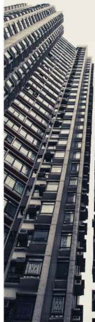
APARTMENT SEARCHING 101